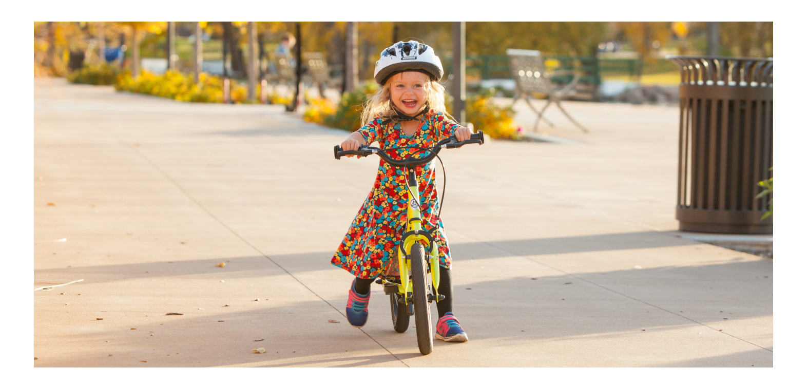
© 2018 Strider Sports International, Inc. All rights reserved. Int'l Pedal Guide 11104

Strider Bikes encourage the development of spatial awareness, balance and basic motor skills as early as possible so all children can reach their maximum riding potential. To ensure your child's bike riding success, we have developed this simple guide to help you along the way.